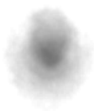
10th iteration of the algorithm.